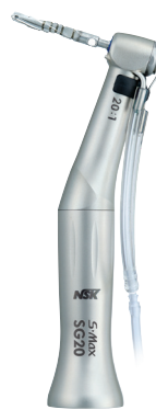
MODEL S-Max SG20 ORDER CODE C1010