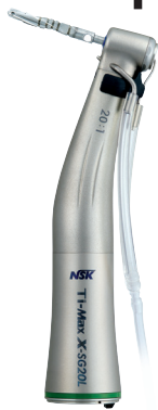
MODEL Ti-Max X-SG20L ORDER CODE C1003