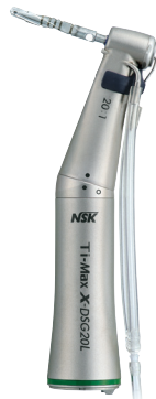
MODEL Ti-Max X-DSG20L ORDER CODE C1068